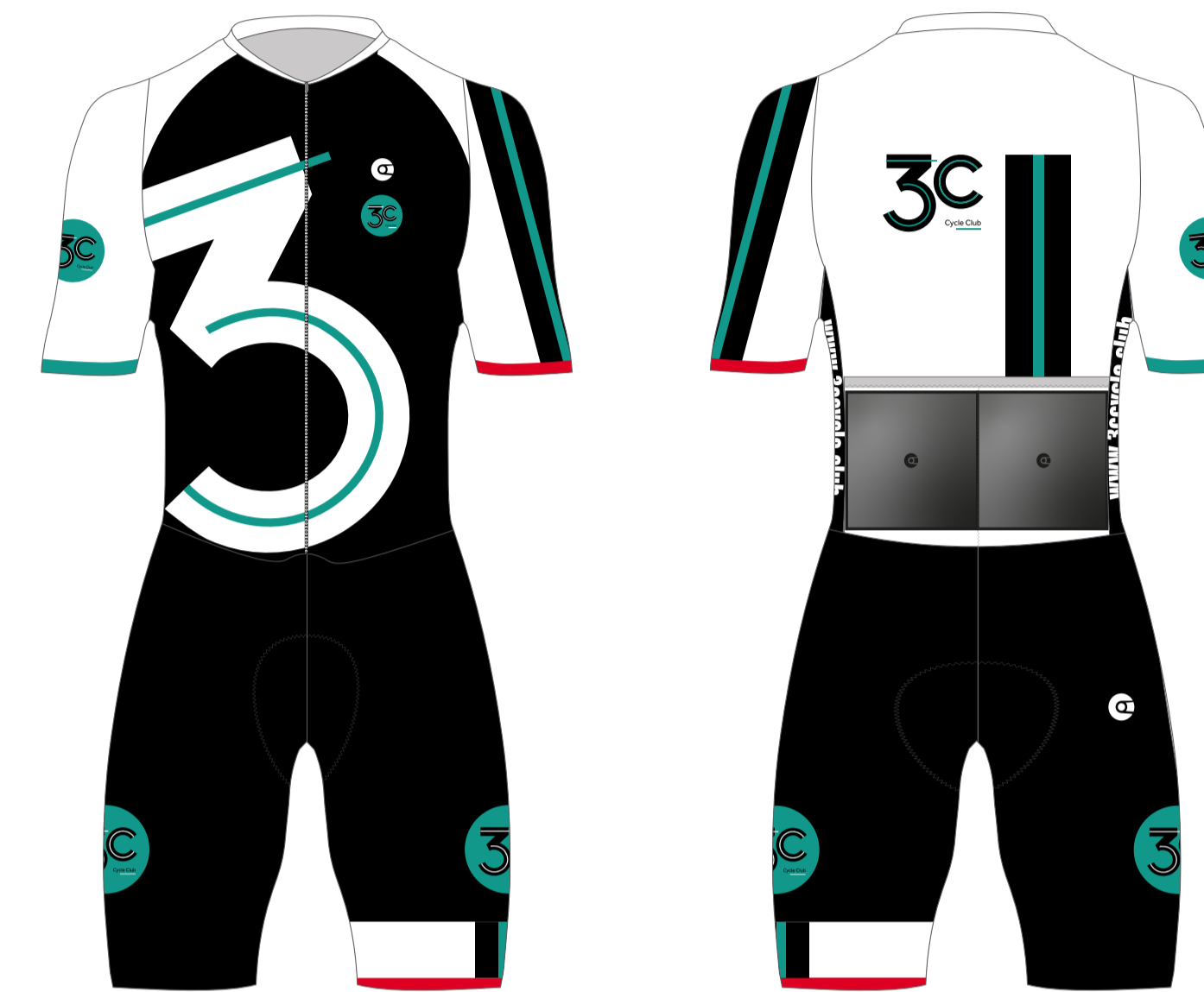
PRO1 ROAD RACE SUIT