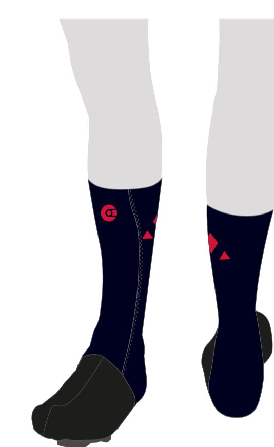
FLOW COVERS (UCI)