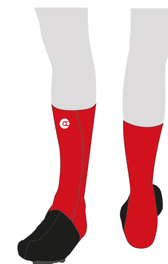
FLOW COVERS (UCI)