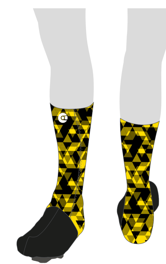
FLOW COVERS (UCI)