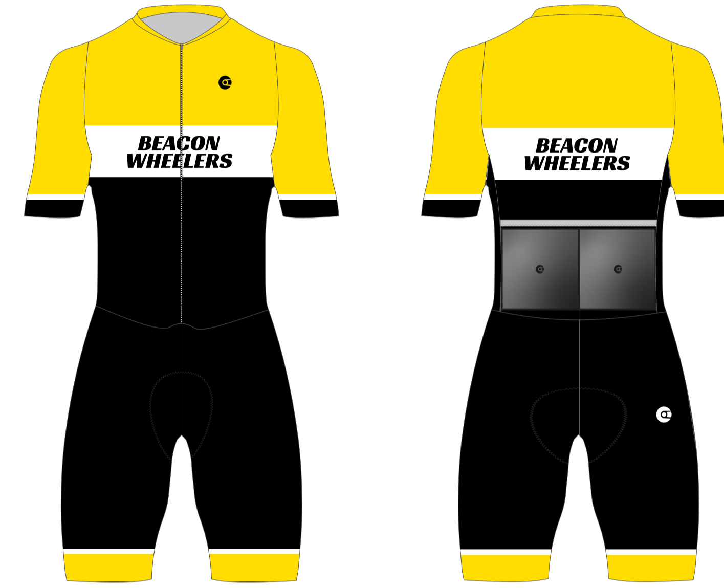
PRO1 ROAD RACE SUIT