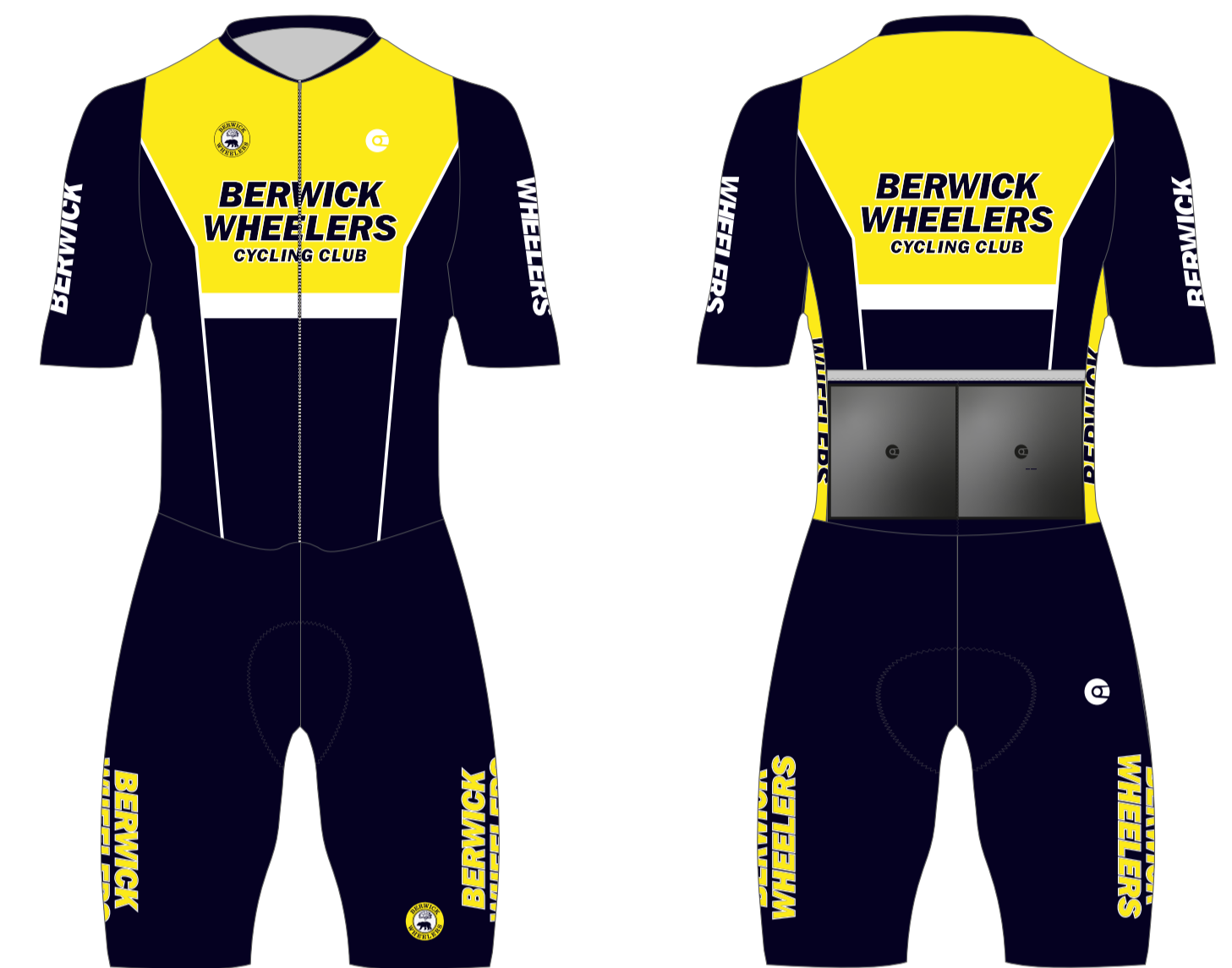
PRO1 ROAD RACE SUIT