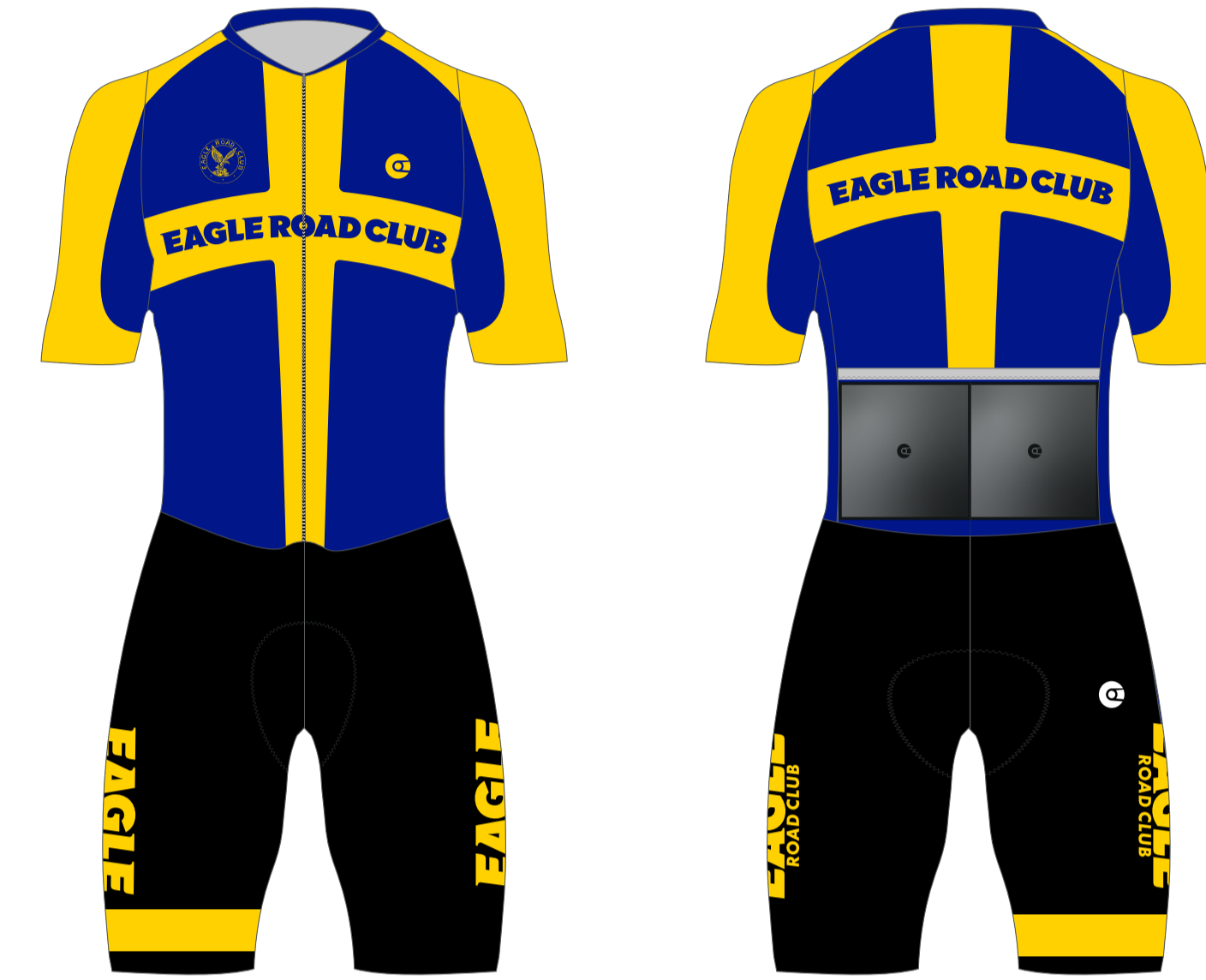
PRO1 ROAD RACE SUIT