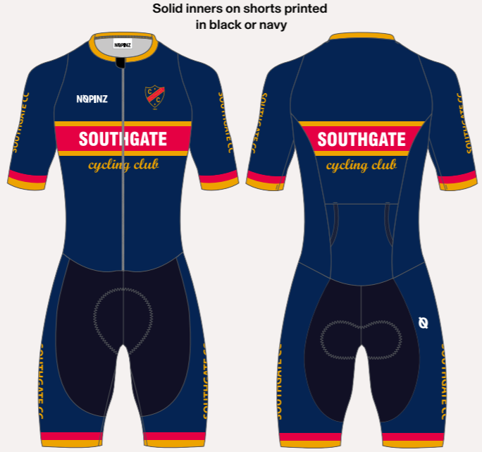
PRO 1 EVO SS TRI SUIT