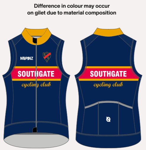
PRO-1 EVO GILET