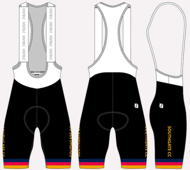
PRO-1 EVO BIB SHORTS