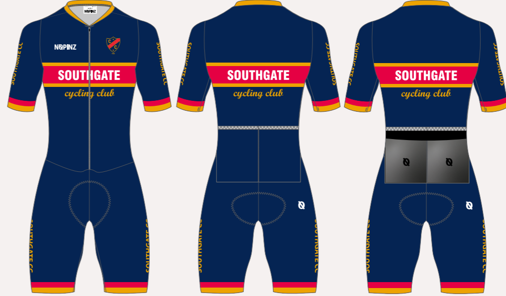
PRO-1 EVO RR SUIT