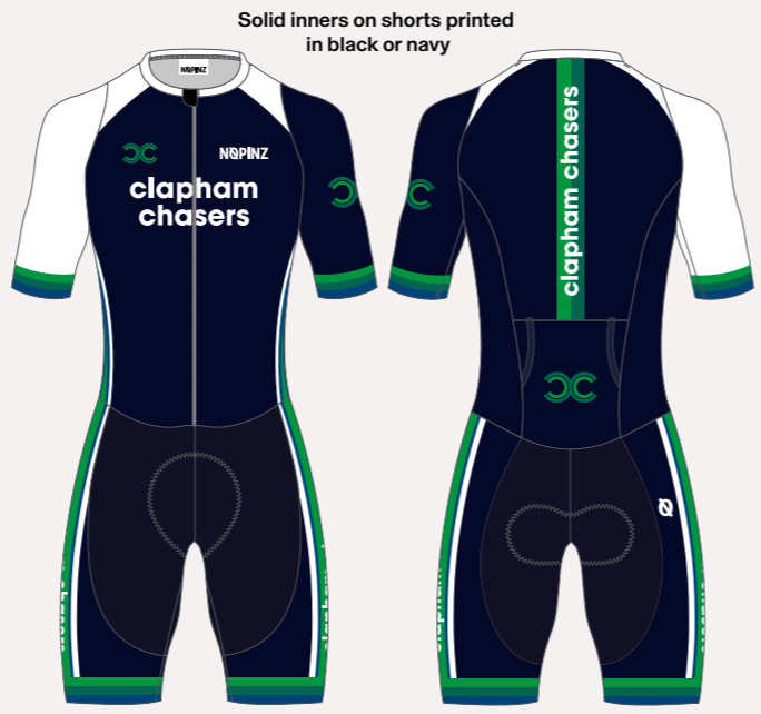
PRO 1 EVO SS TRI SUIT