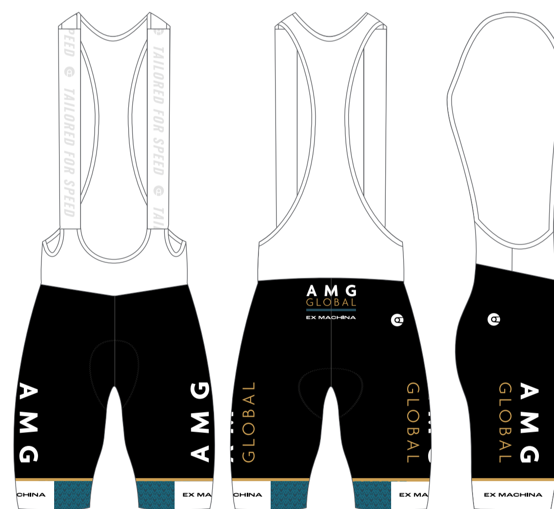
PRO-1 BIB SHORTS