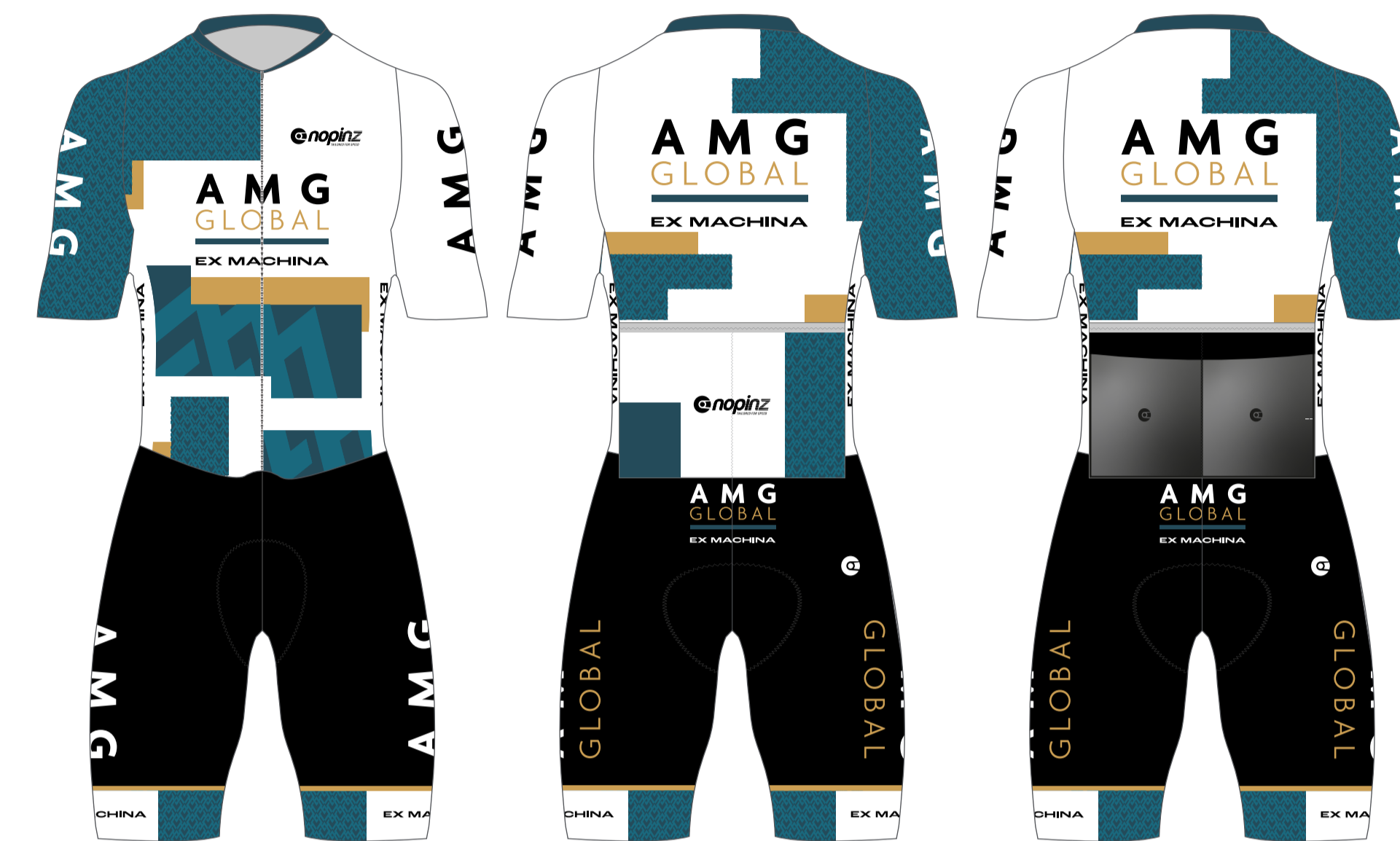
PRO-1 ROAD SKINSUIT