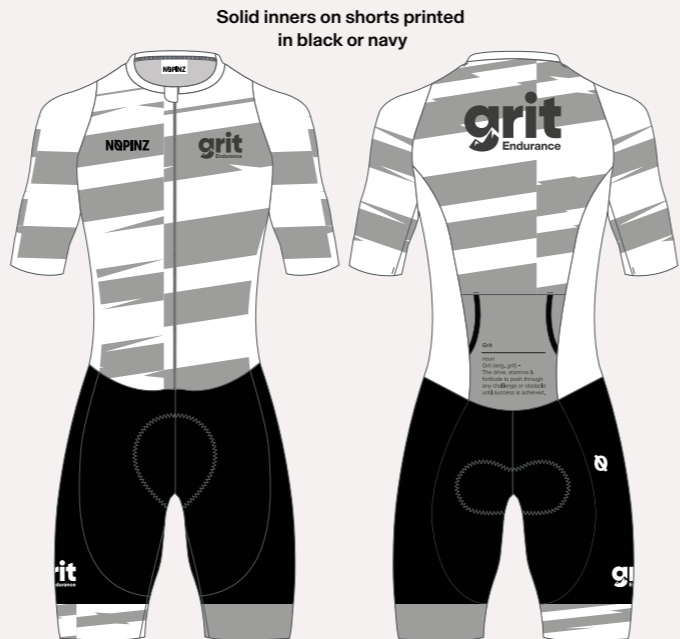
PRO 1 EVO SS TRI SUIT