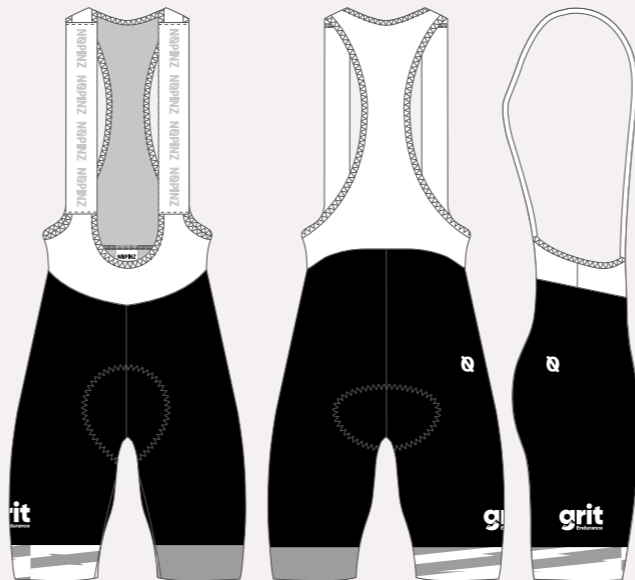
PRO-1 EVO BIB SHORTS