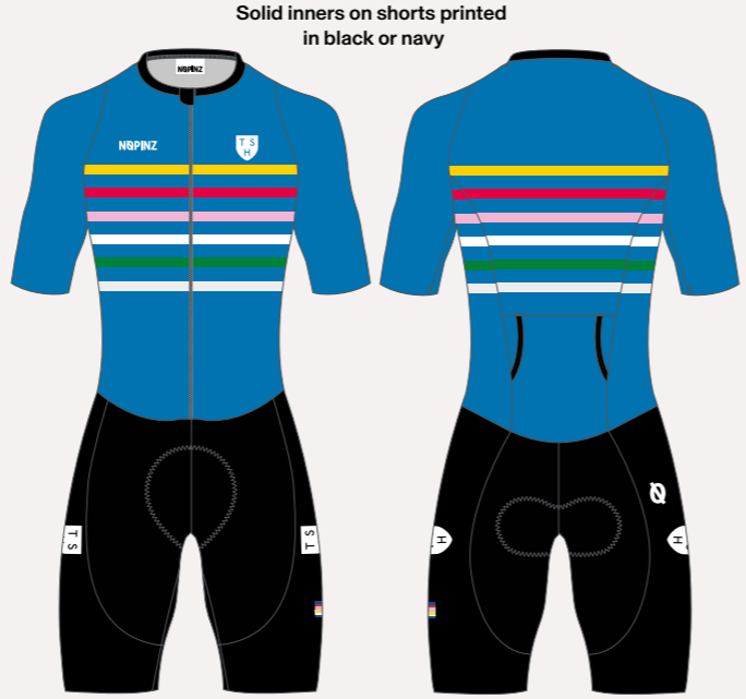
PRO 1 EVO TRISUIT