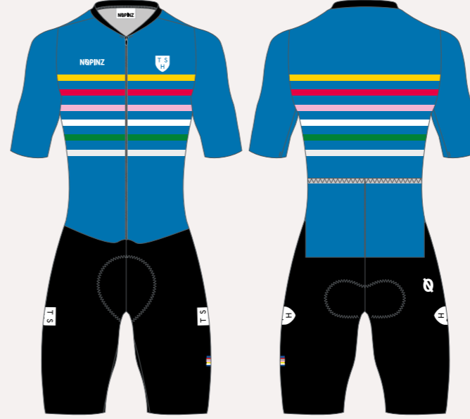
PRO-1 EVO RR SUIT