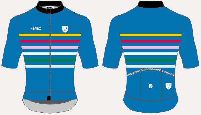
PRO-1 EVO JERSEY