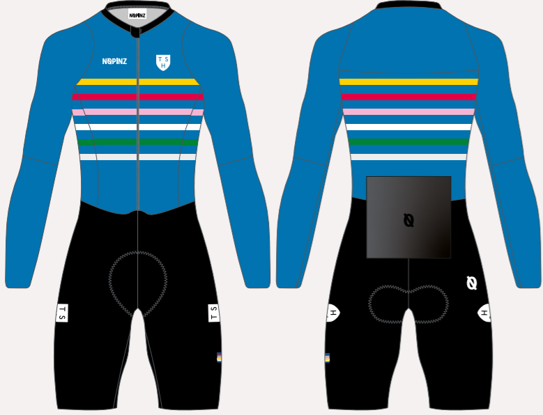
HYPERSONIC LIGHT SUIT