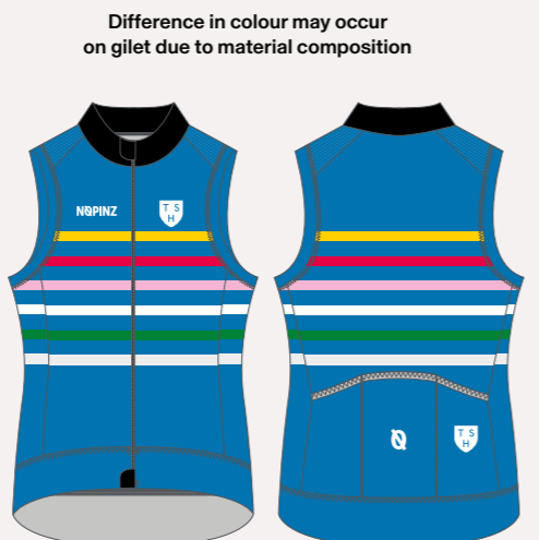
PRO-1 EVO GILET