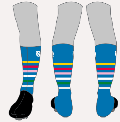
HYPERSONIC OVERSHOES UCI