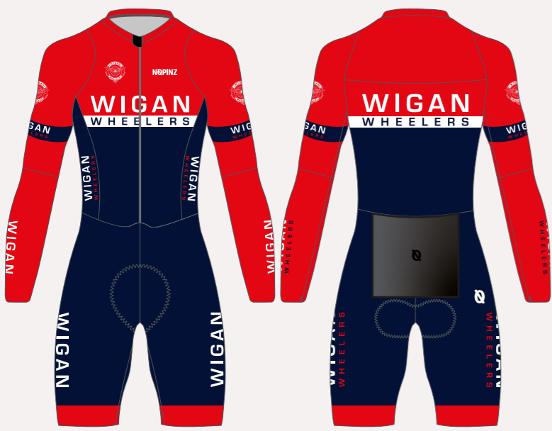
HYPERSONIC LIGHT SUIT