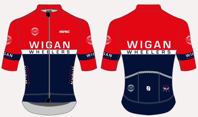
PRO-1 EVO JERSEY