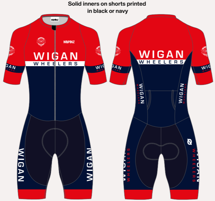
PRO 1 EVO TRISUIT