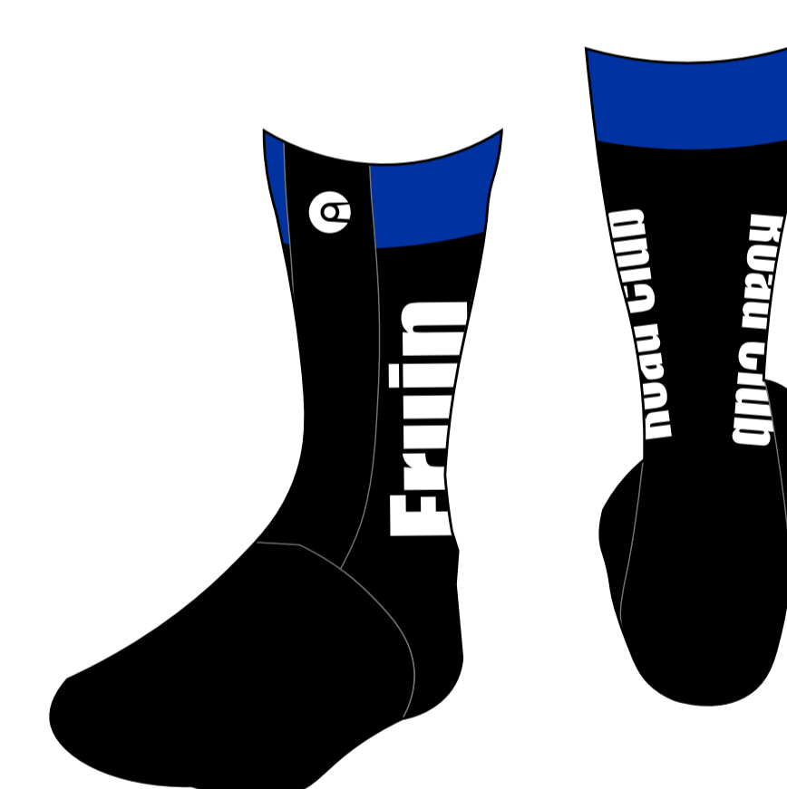
FLOW COVERS (UCI)