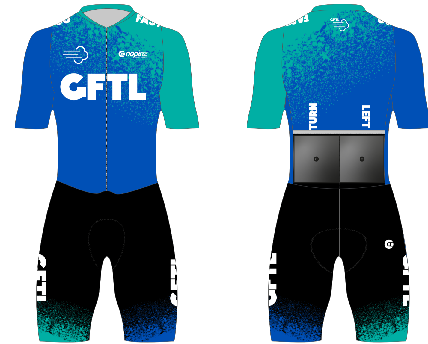
TRACK POCKET DESIGN