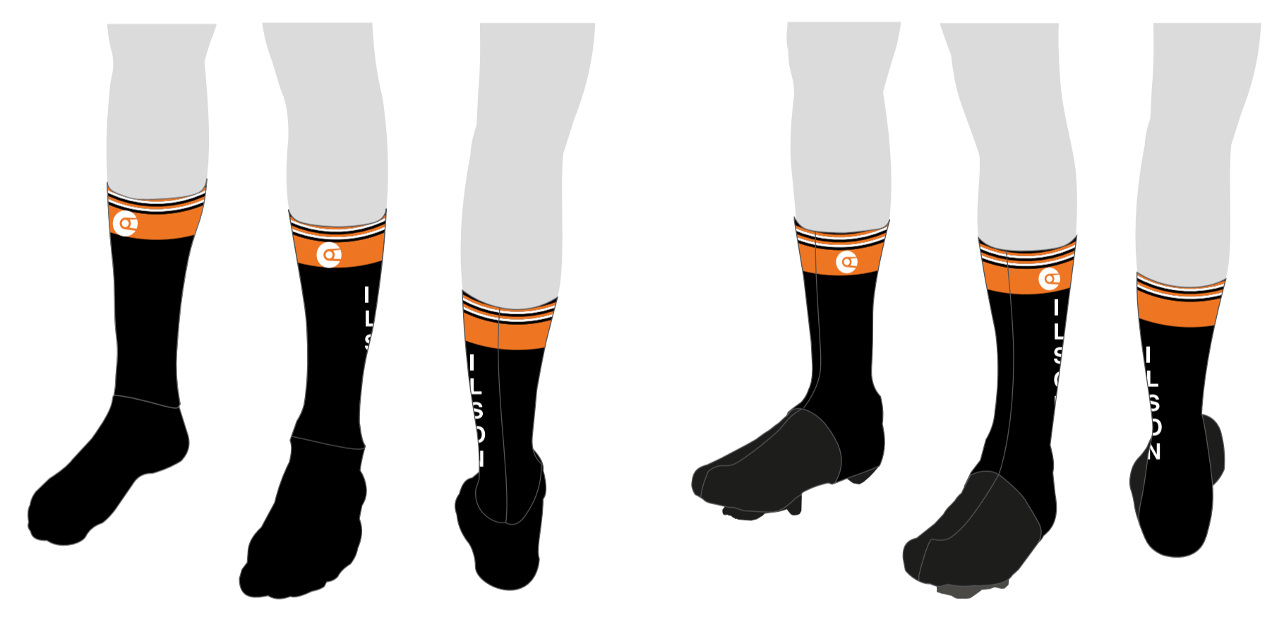
PRO-1 SOCKS HYPERSONIC OVERSHOES UCI