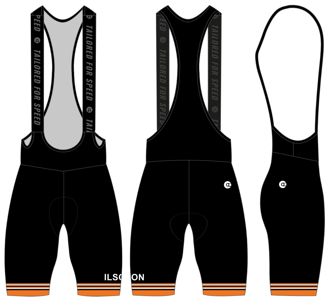
PRO-1 BIB SHORTS