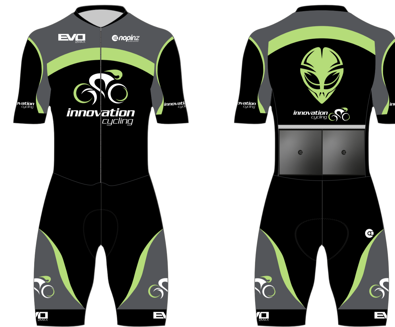
PRO1 ROAD RACE SUIT