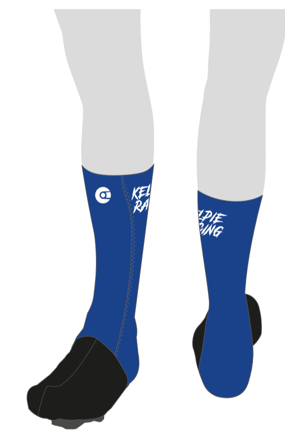
FLOW COVERS (UCI)