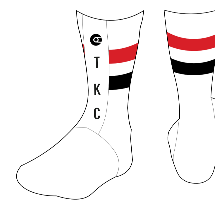
FLOW COVERS (UCI)