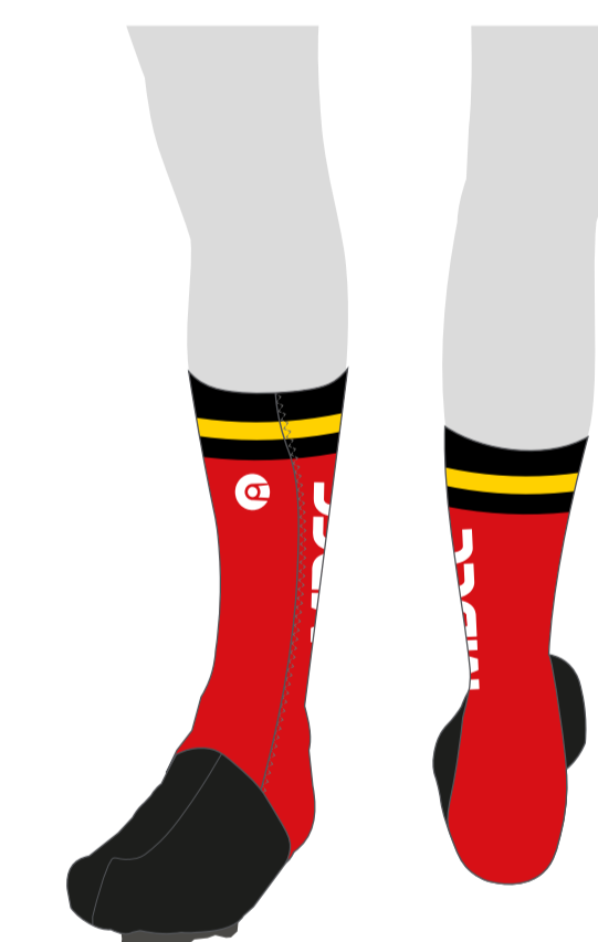
FLOW COVERS (UCI)