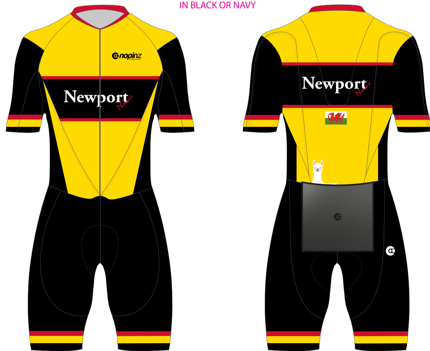
FLOW SUBZERO SUIT

SOLID INNERS ON SHORTS PRINTED IN BLACK OR NAVY