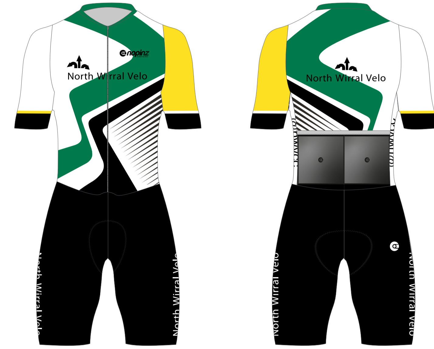
PRO1 ROAD RACE SUIT