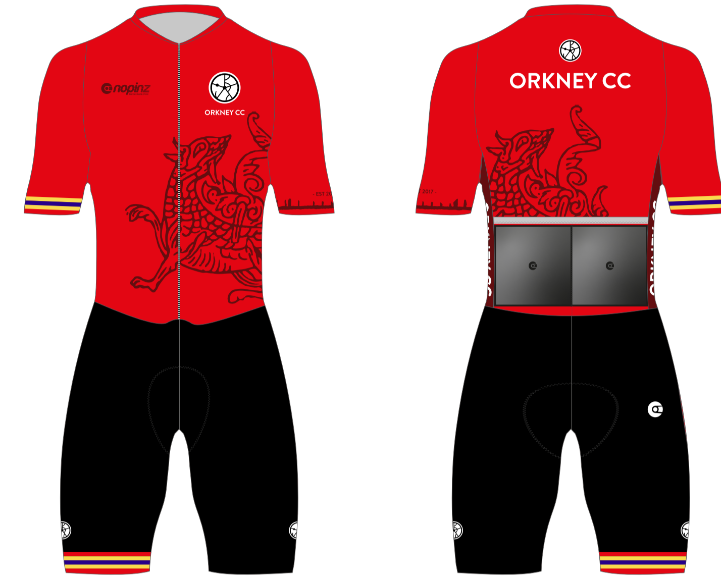
PRO1 ROAD RACE SUIT