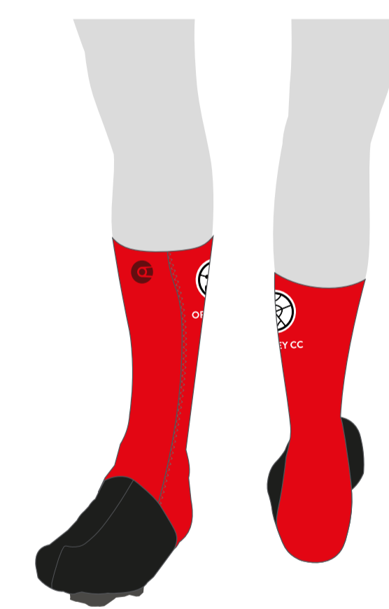
FLOW COVERS (UCI)