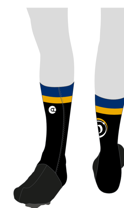
FLOW COVERS (UCI)