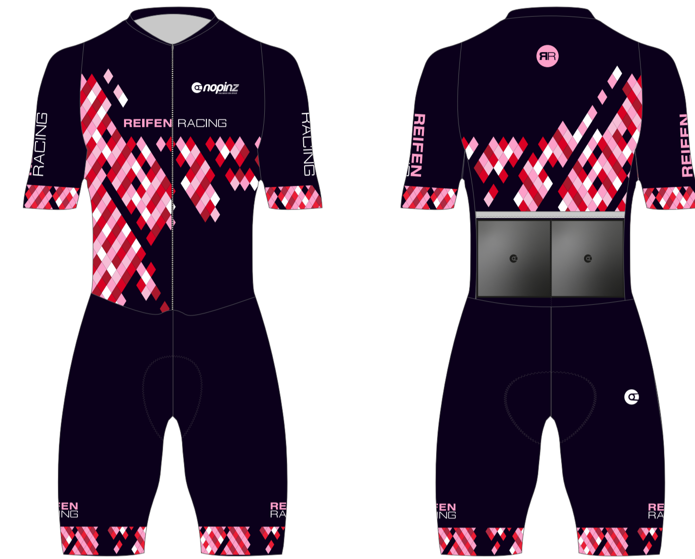
PRO1 ROAD RACE SUIT