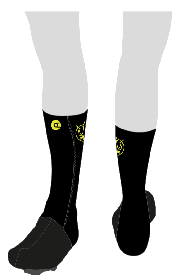
FLOW COVERS (UCI)