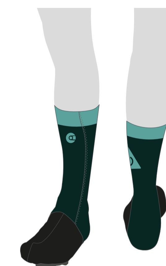
FLOW COVERS (UCI)