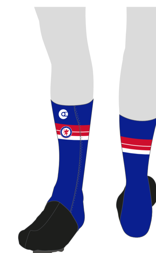
FLOW COVERS (UCI)