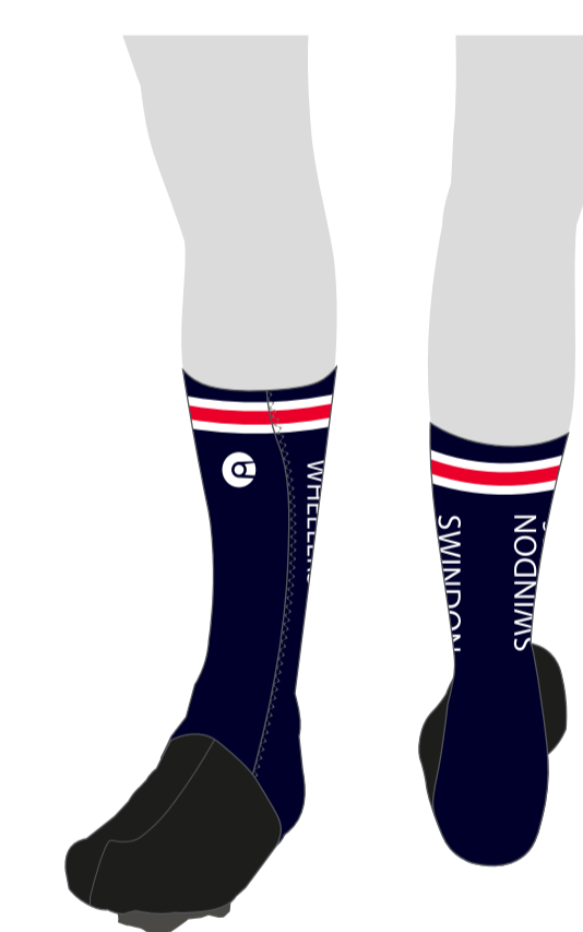
FLOW COVERS (UCI)