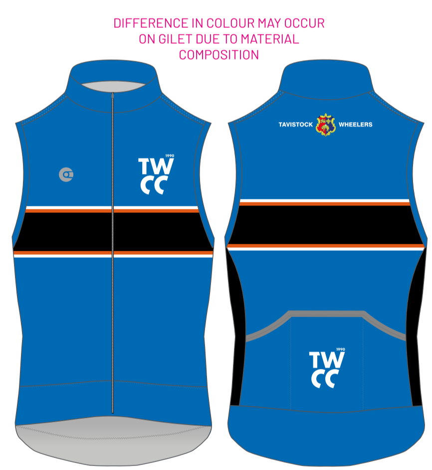
PRO-1 EVO GILET