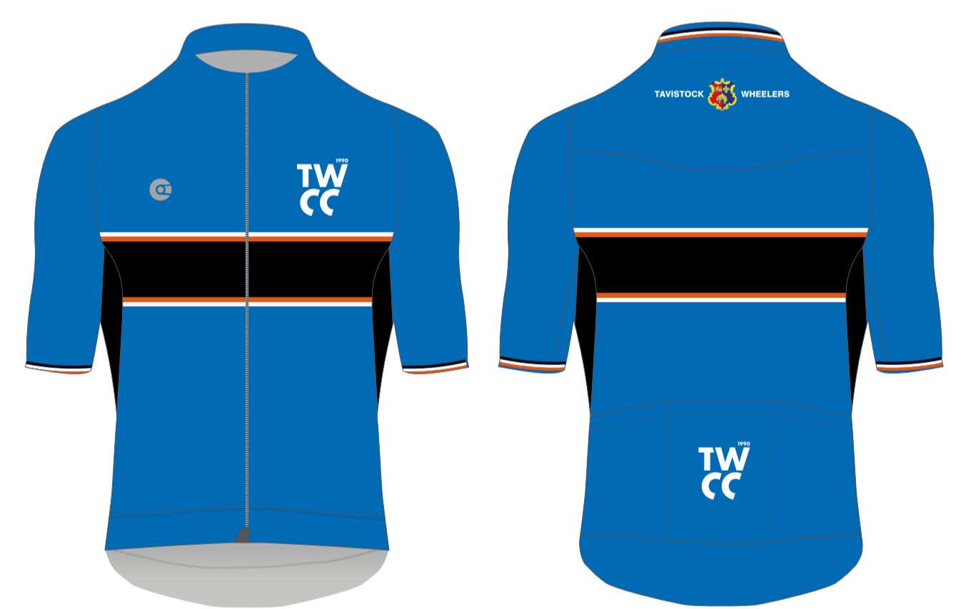
PRO-1 EVO MAX JERSEY