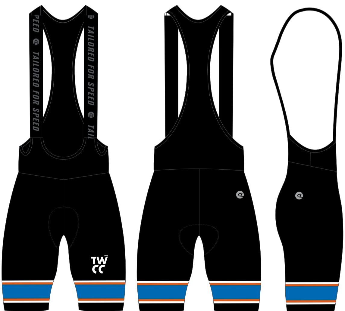
PRO-1 EVO BIB SHORTS