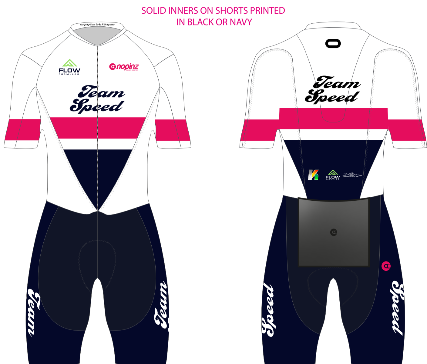
FLOW SUBZERO SUIT