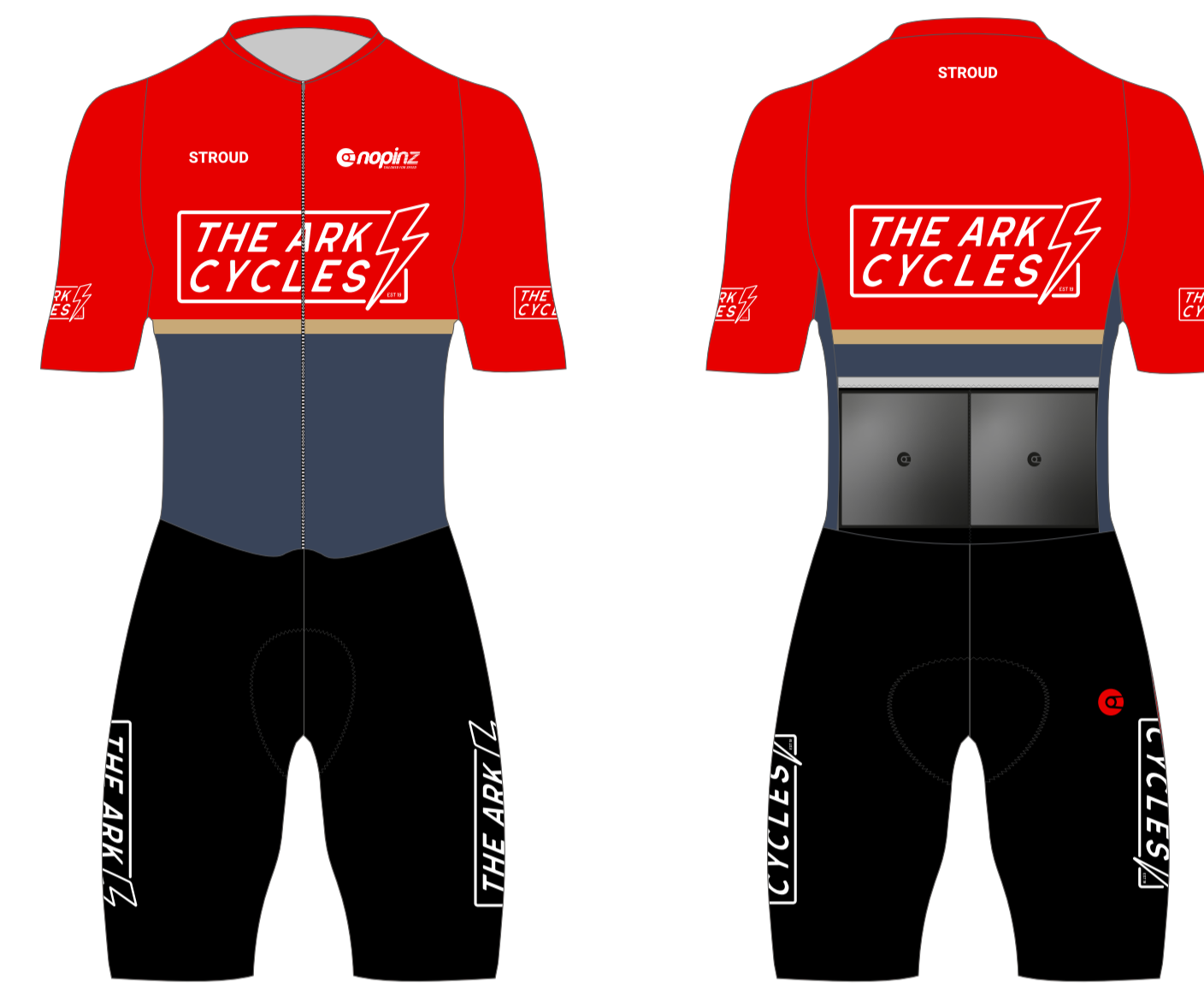
PRO1 ROAD RACE SUIT