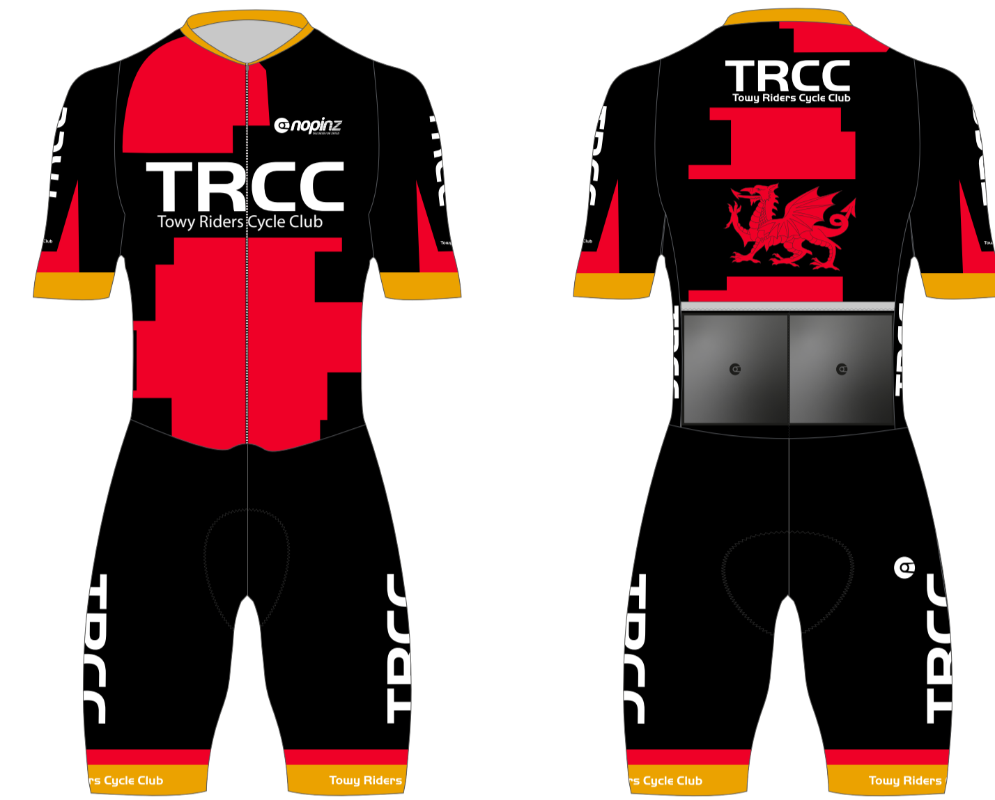
PRO1 ROAD RACE SUIT