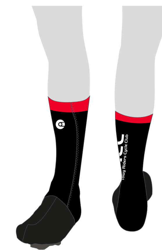
FLOW COVERS (UCI)