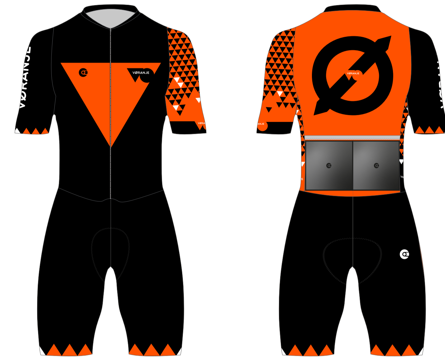
PRO1 ROAD RACE SUIT