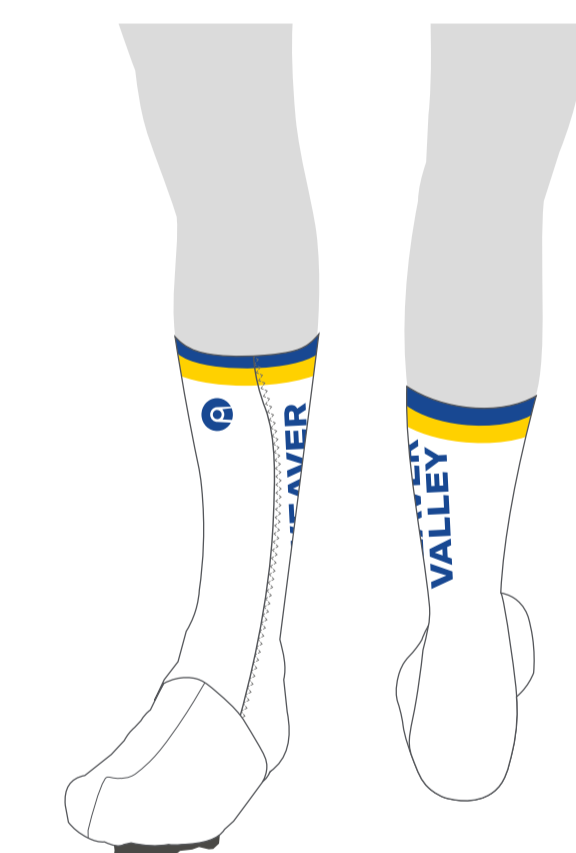
FLOW COVERS (UCI)