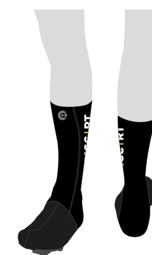
FLOW COVERS (UCI)