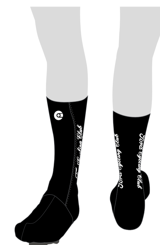
FLOW COVERS (UCI)