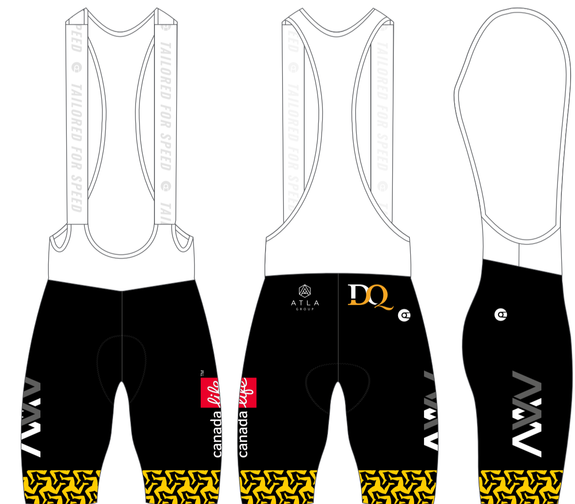
PRO-1 BIB SHORTS