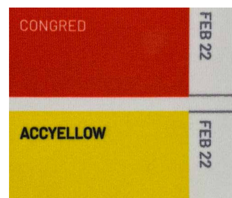
IMAGE HAS BEEN USED FOR THE DOT PATTERN.

THE PATTERN WILL NOT MATCH PERFECTLY ACROSS STITCHED SEAMS, WE CAN ONLY DO OUR BEST TO MAKE THE DESIGN MATCH.