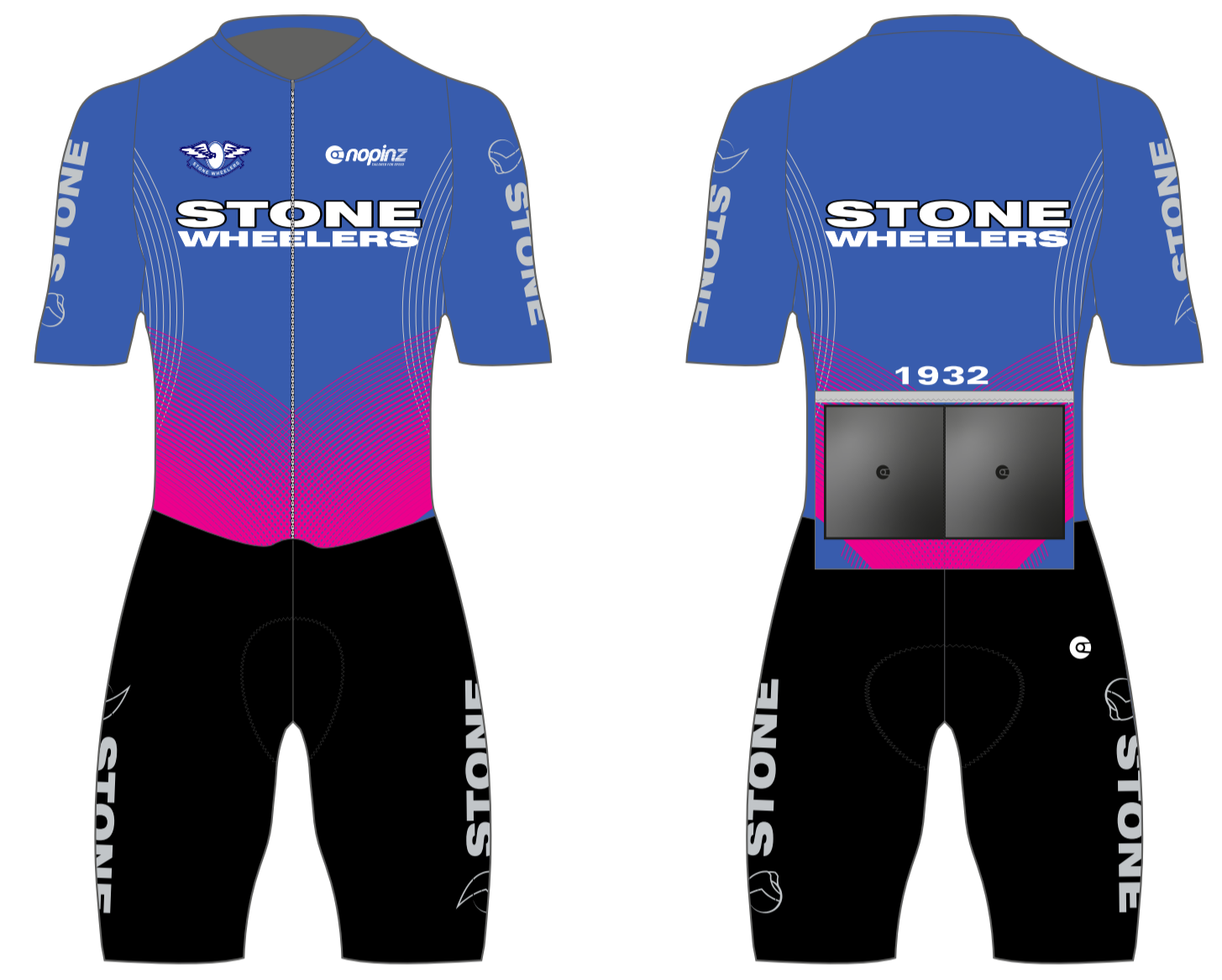
PRO1 ROAD RACE SUIT