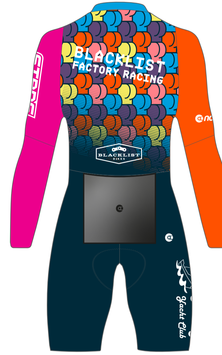
TRACK POCKET DESIGN