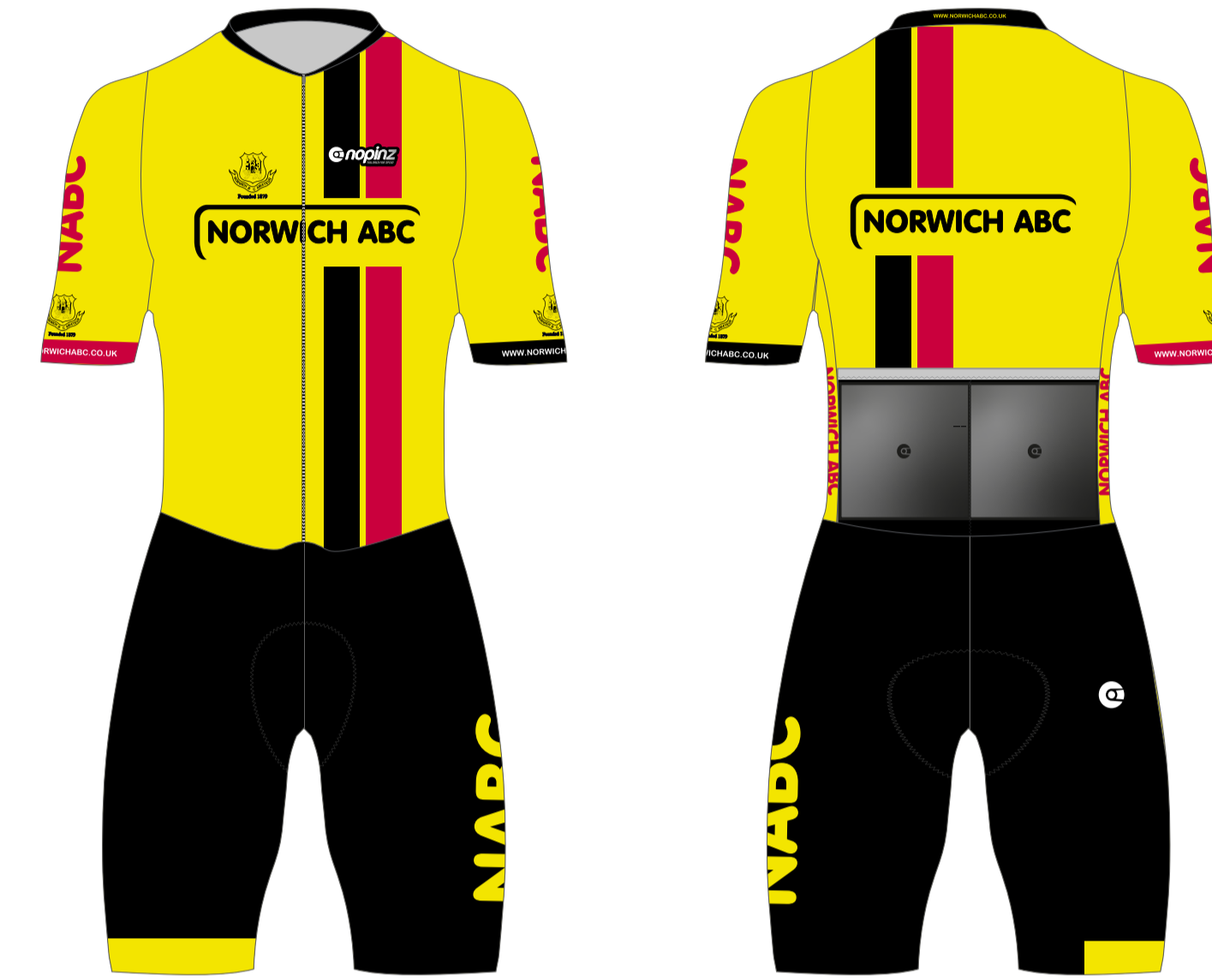
PRO1 ROAD RACE SUIT