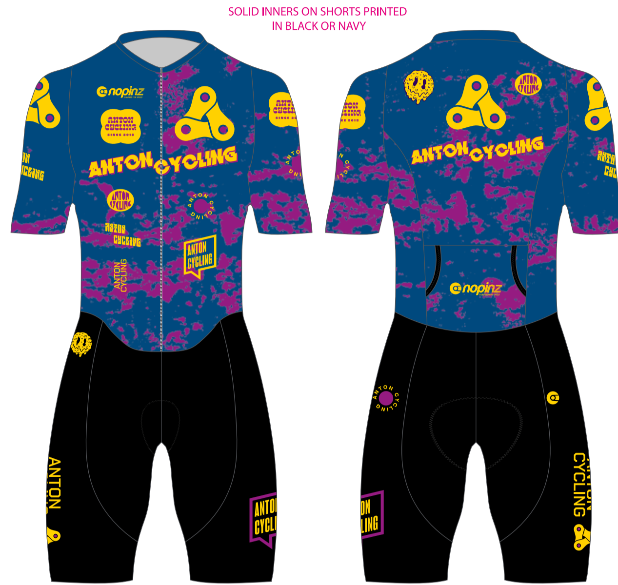
PRO 1 EVO SS TRI SUIT