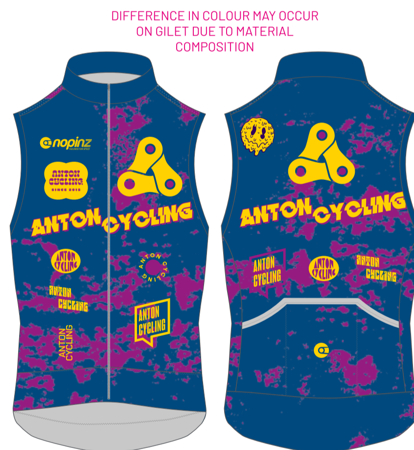
PRO-1 EVO GILET