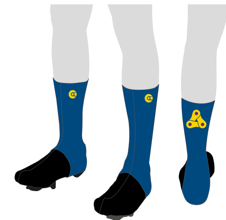
HYPERSONIC OVERSHOES UCI