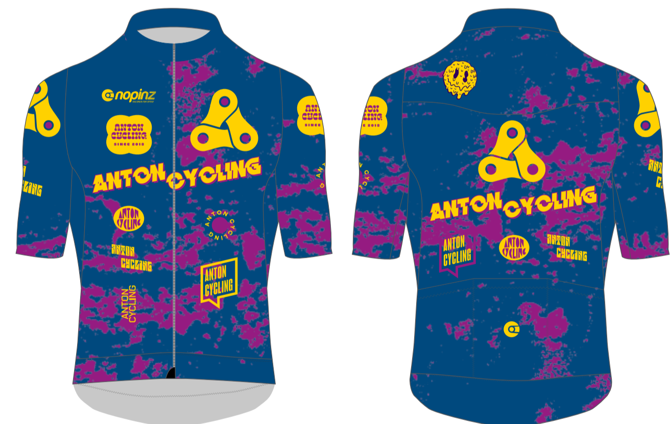
PRO-1 EVO MAX JERSEY