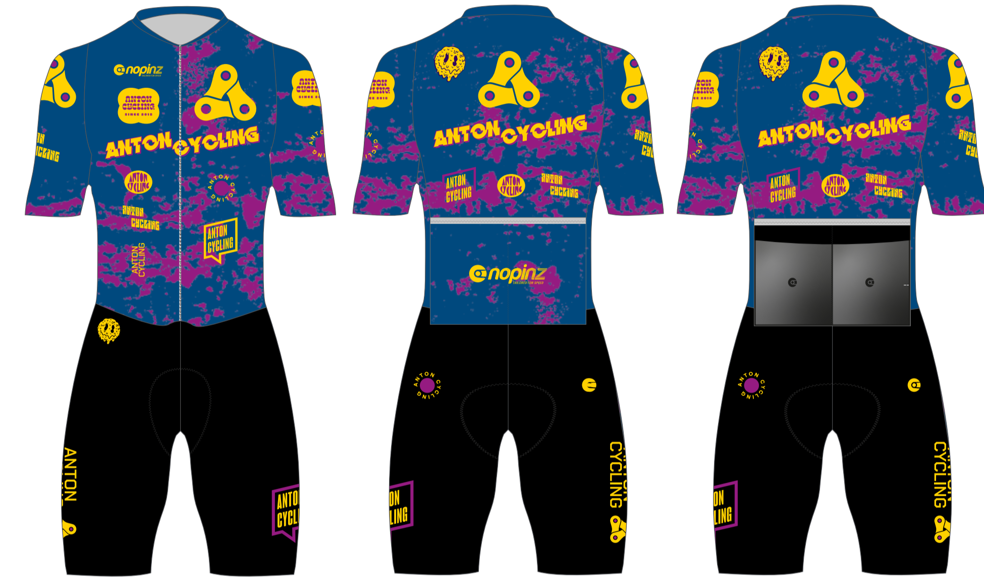
PRO-1 EVO RR SUIT