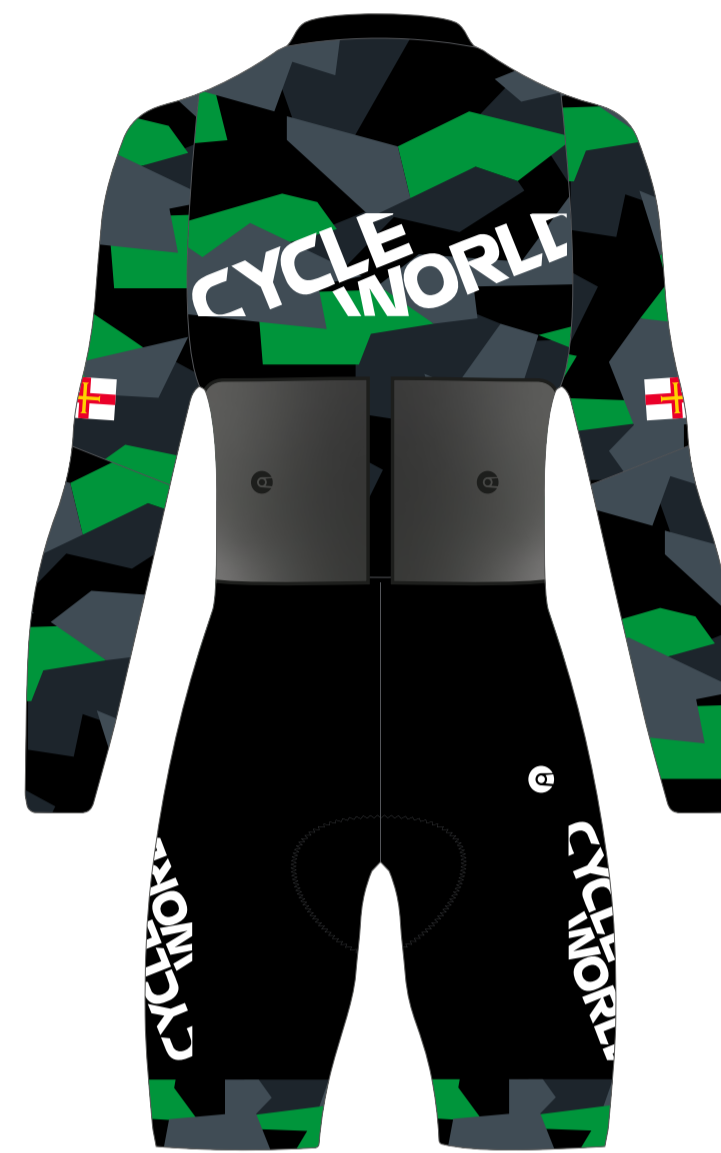
TRACK POCKET DESIGN