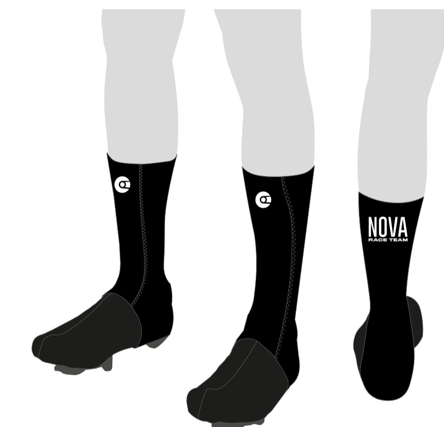
FLOW COVERS (UCI)