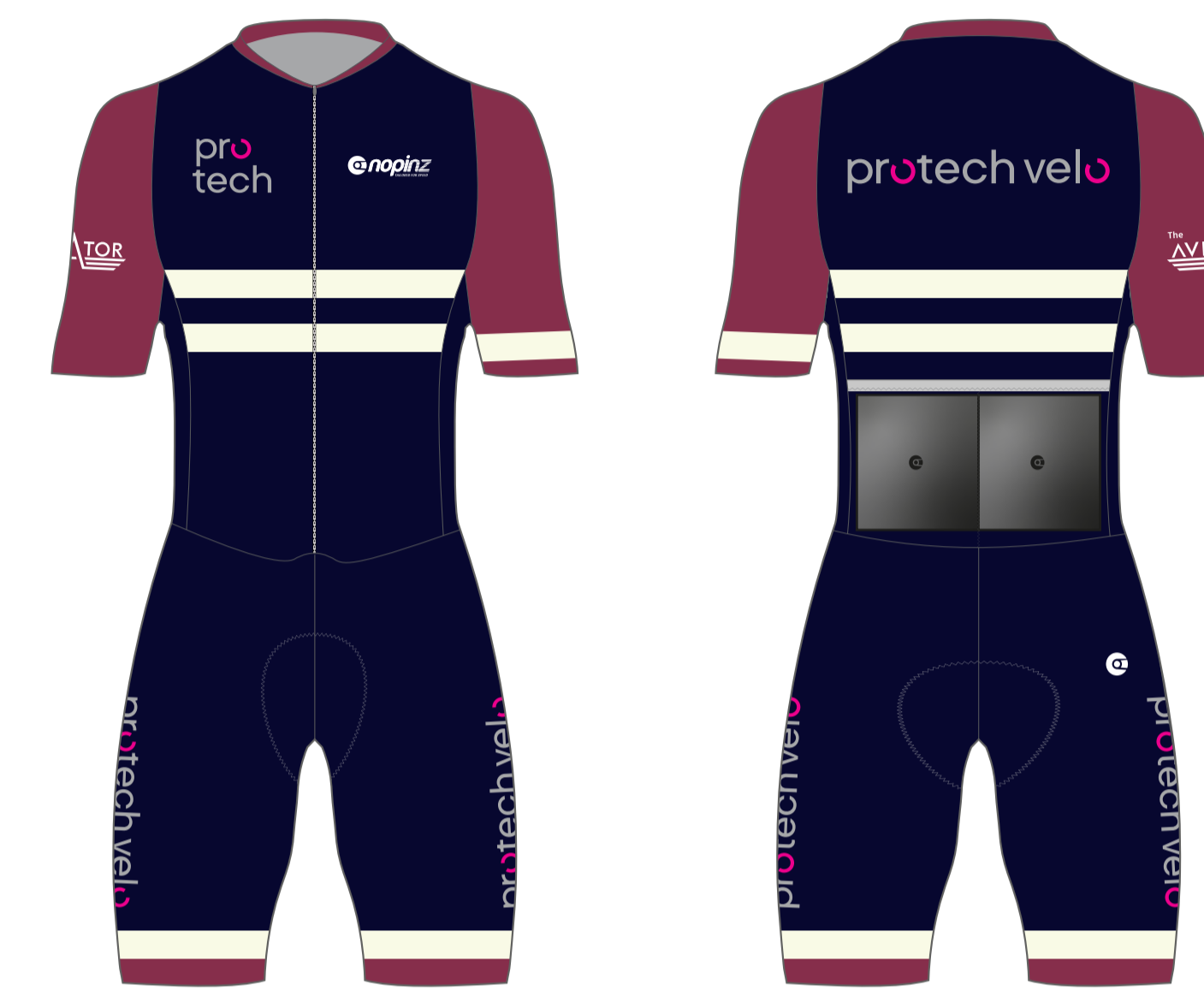
PRO1 ROAD RACE SUIT