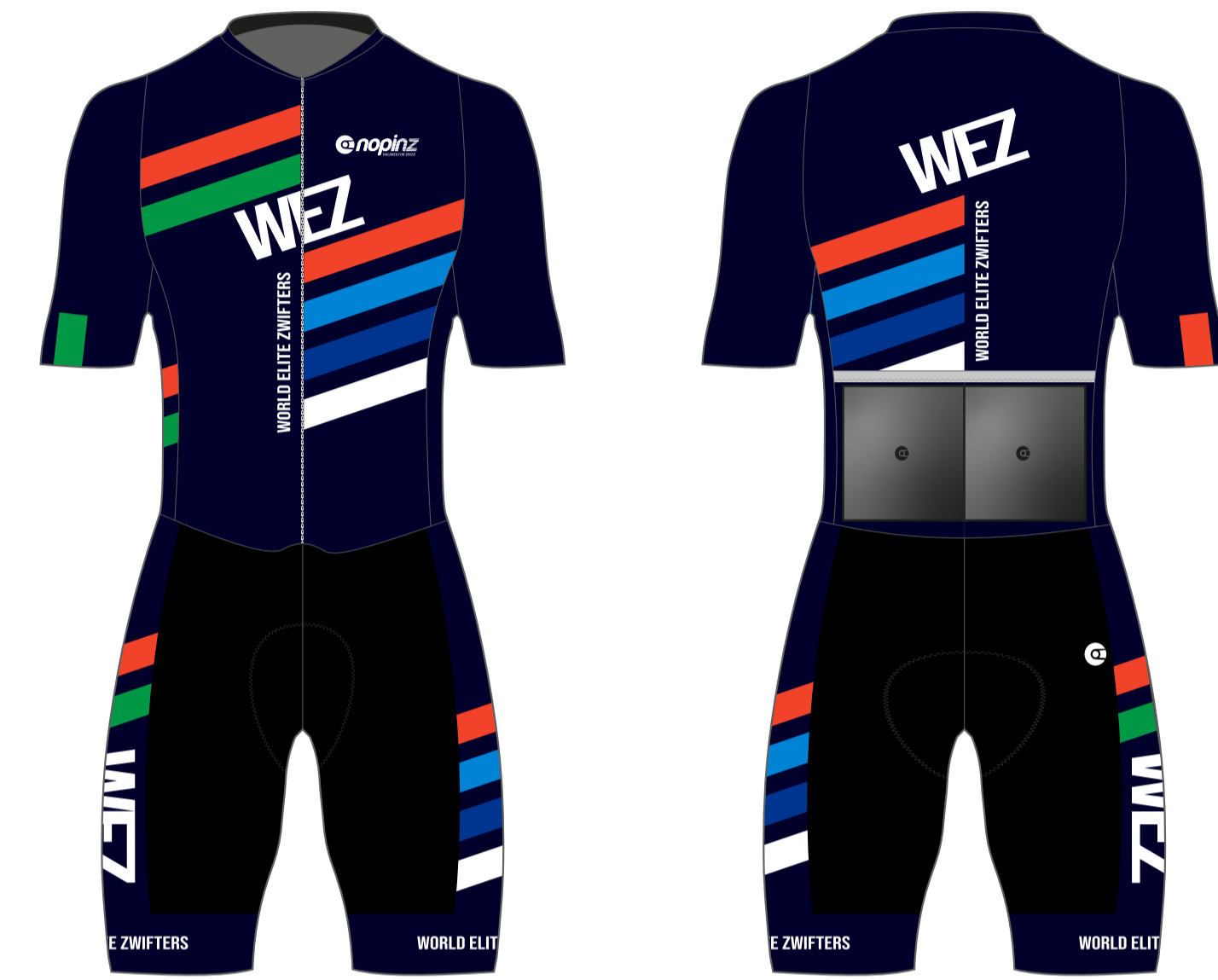
PRO1 ROAD RACE SUIT