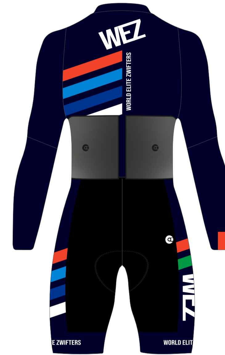
TRACK POCKET DESIGN