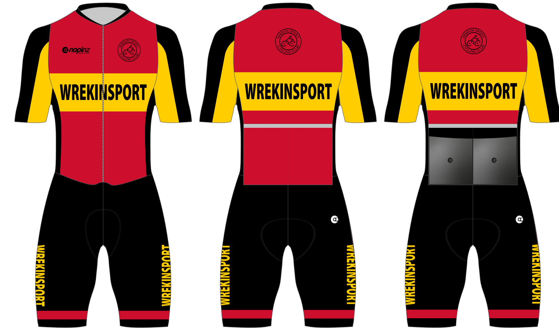
PRO-1 ROAD SKINSUIT