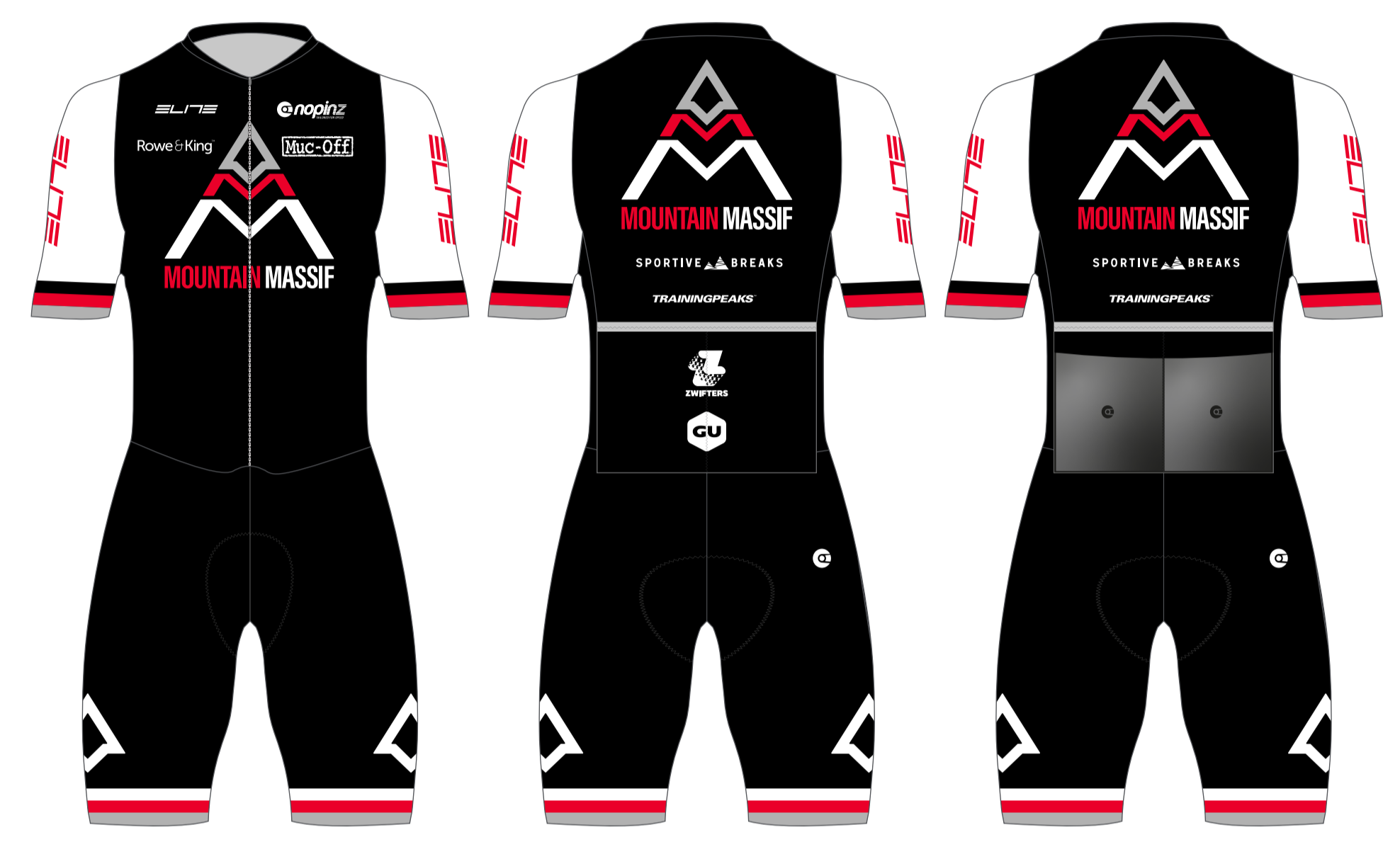
PRO-1 ROAD SKINSUIT