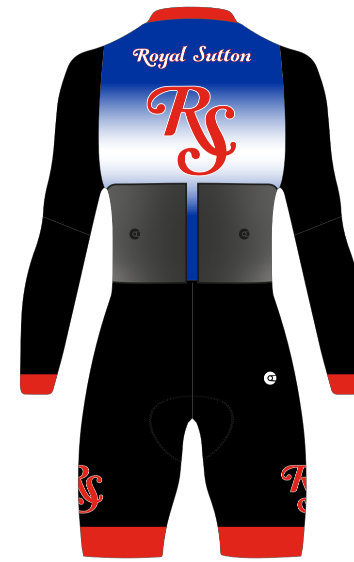
TRACK POCKET DESIGN