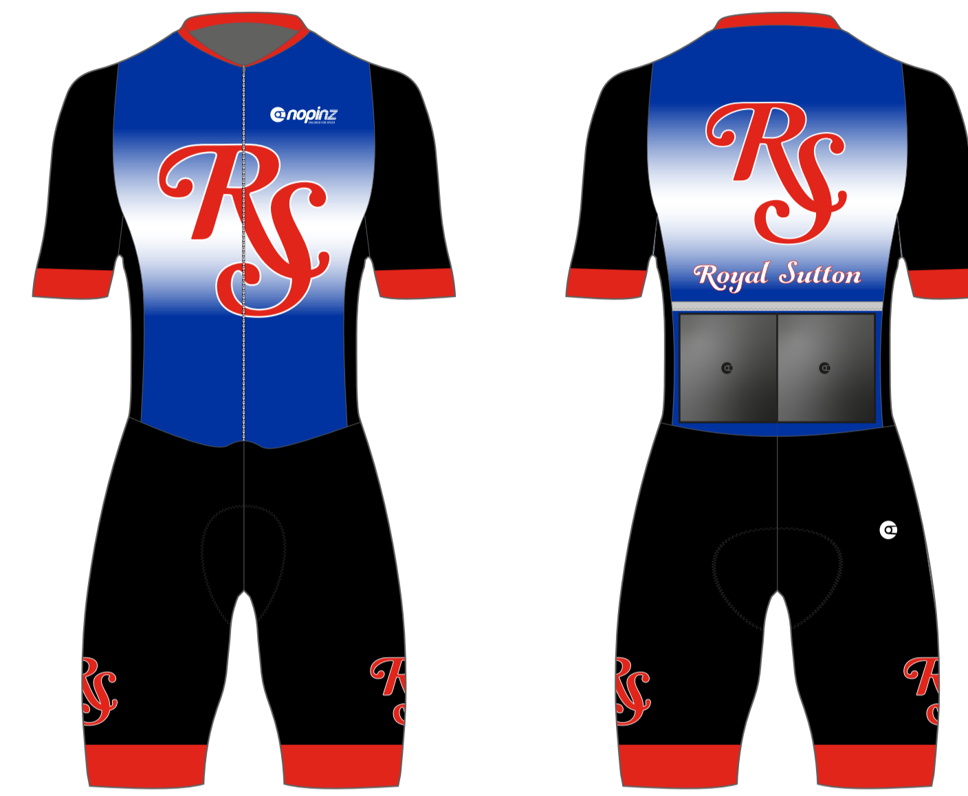
PRO1 ROAD RACE SUIT