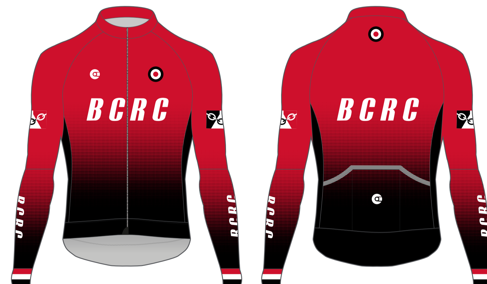
PRO1 ROUBAIX JERSEY